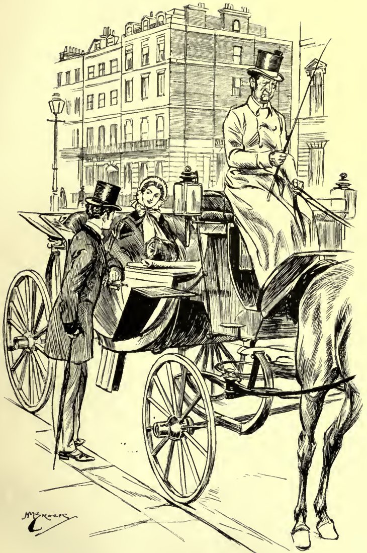
'How grave you look!' said she